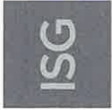
Exhibit A Judicial Ditch No 15 Renville County, Minnesota Tuesday, October 24, 2023