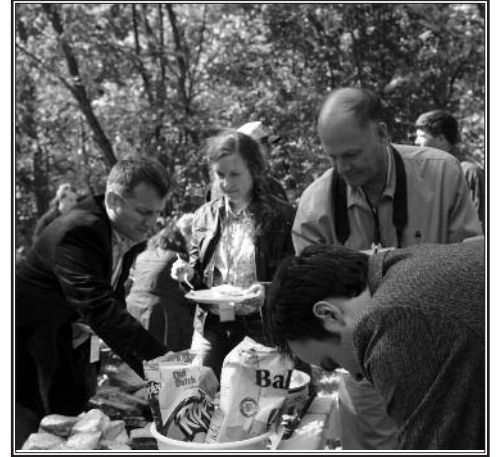
The delegation enjoys a picnic lunch in Birch Coulee Park.

These specialty doors have been designed and built with a modern flare and have been installed all over the world in businesses such as the Red Bull Headquarters in Santa Monica, California, a shop in the Dallas Galleria mall, Cycle City in Maui, Hawaii, store fronts in Bushwick, New York, Shanghai, China and even the Guthrie theatre in Minneapolis.