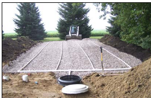
Photo: Installation of a septic drainfield.

Middle Minnesota River Watershed (320) 523-3706