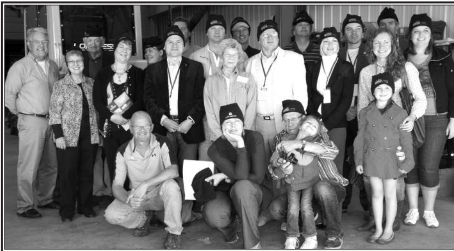
A delegation of Ukrainian guests and Renville County commissioners, staff and family members sporting Loftness manufacturing hats at the completion of the Loftness plant tour.

A historic civic leadership exchange was held during the week of September 25th in and around the St Paul and Minneapolis metro area and in Renville and Kandiyohi counties. In Renville County the exchange was between government officials, professionals, students, and family members from Boryspil, Ukraine and the county administrator, two county commissioners, department heads, county staff, family members and individuals from private enterprise in Renville County held on September 29th. The first exchange of this group was a pilot program designed to provide a civic leadership sharing experience held in May, 2011 in Boryspil,