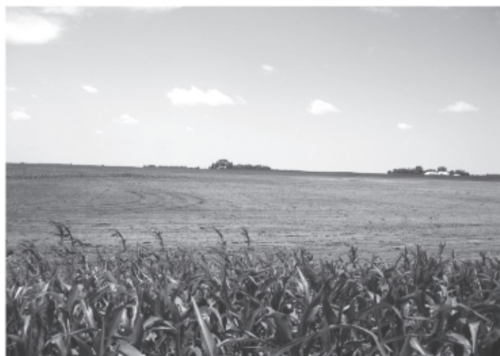
Above: A field located in Renville County with an area of “drowned-out” crops.

If you are tired of trying to farm those drowned-out spots, please contact Ryan Clark at Renville SWCD by phone at 320-523-1559, email Ryan.Clark@mn.nacdn.net , or stop by our office in Olivia to discuss alternatives to tile drainage.