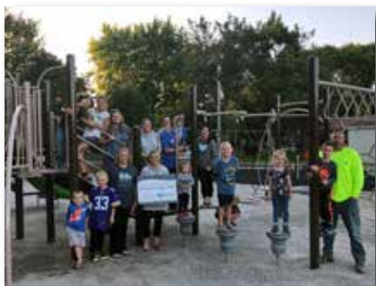
Playground Committee members accepting grant for new City of Danube playground.

awarded $1,000 that will be put toward replacement of the city park playground equipment and a community club house addition.