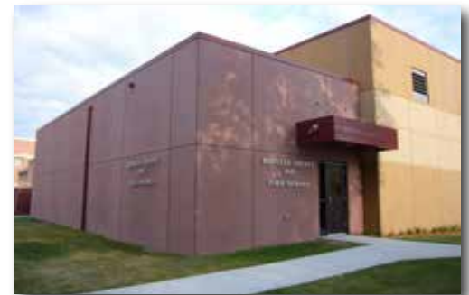
Renville County Jail Public Entrance

We are unique in having a licensed chemical dependency treatment program within the walls of the facility. This is run by New Beginnings of Waverly, a Meridian company. Our philosophy is that we do our level best to give people the tools needed to succeed before they leave the jail. RCJ does not pay anything for this service to be offered in our facility.