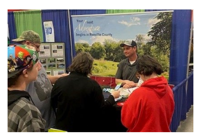
Photo right: Renville County HRA/EDA & Parks' booth at the KWLM Home and Outdoor Expo on April 5<sup>th</sup> and 6<sup>th</sup> in Willmar.

The Renville County HRA/EDA partnered with the County Parks Department to have a booth at the KWLM Home & Outdoor Expo on Friday & Saturday, April 5th and 6th in Willmar. This was a good opportunity to market the County and our programs.