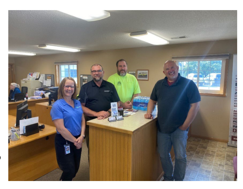
Photo right: Manufacturing Week deliveries at K&S Millwrights in Buffalo Lake on Thursday, October 10th.

October is "Manufacturing Month" – a time to recognize our local manufacturing businesses. The manufacturing sector is the largest employer in Renville County, and on average manufacturing jobs pay significantly above average wages. We visited the manufacturing businesses in October and delivered cookies & bottled water, along with thank you notes for the employees.