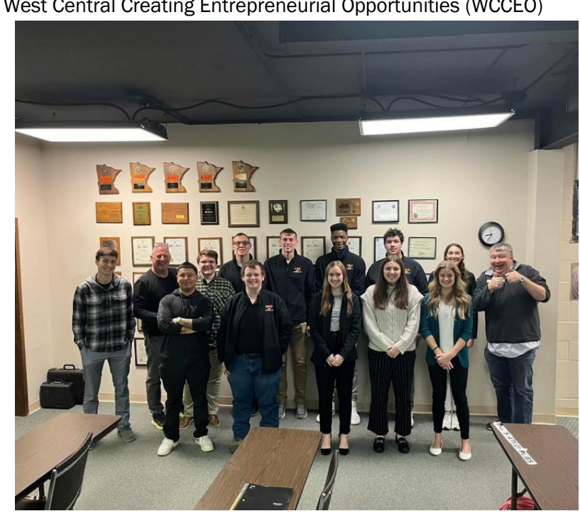
Photo right: Staff work with the West Central CEO students on their "Elevator Pitches" and business plans on Friday, February 9, 2024.

program – a collaboration of RCW, Prinsburg, MACCRAY & KMS Schools. This is a 4-day per week class students can take for credits, where students tour businesses, meet with entrepreneurs, start class and personal businesses and learn entrepreneurship and life skills. Staff serve on the WCCEO board, and often present to and coach students on entrepreneurship and related topics.