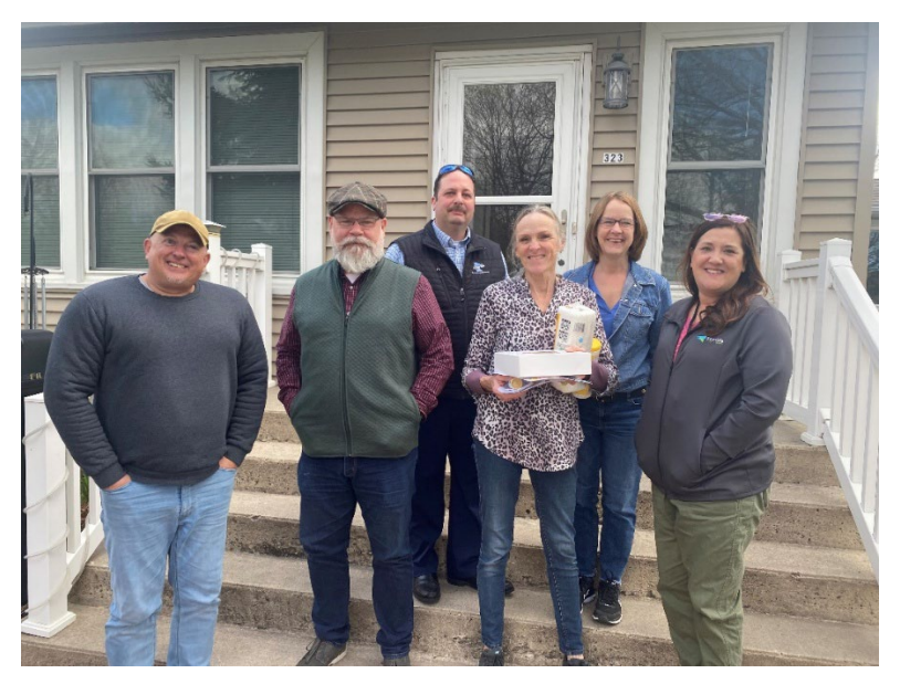
Hable - Renville County Childcare Licensing.