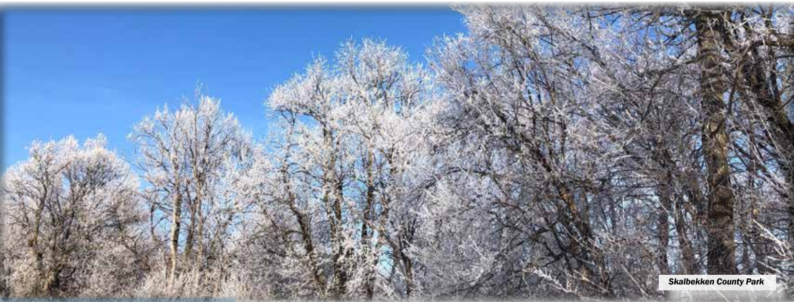
Skalbekken County Park