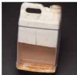
Bottom is caked with dried residue.