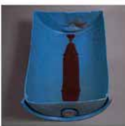
Liquid residue in container.