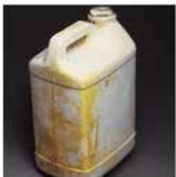
Dried formulation on container.