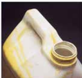
Dried formulation on thread.