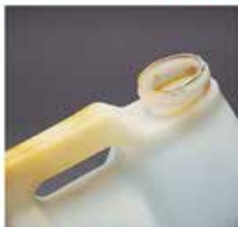
Handle and neck stained but clean.