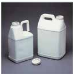
Container, thread, and lip are clean.