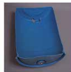
Inside is clean and dry.