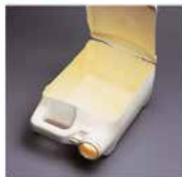
Inside stained but rinsed clean.