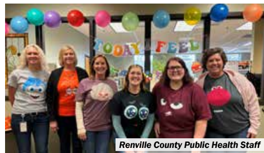
Renville County Public Health Staff

Public Safety: Protect your community through roles in emergency response, dispatch, law enforcement, jail and more - not just boots on the ground, but behind-the-scenes tech and logistics too.