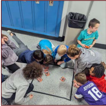
Sumo Wrestling (Robotics)