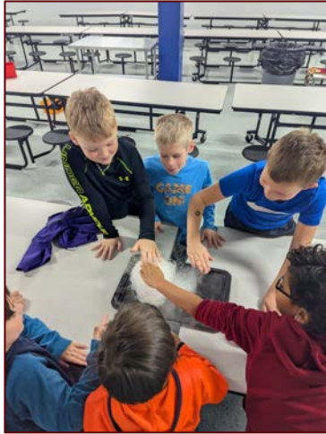
Dry Ice (Snow & Ice)