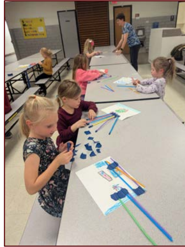
STEM & Building (Architecture)